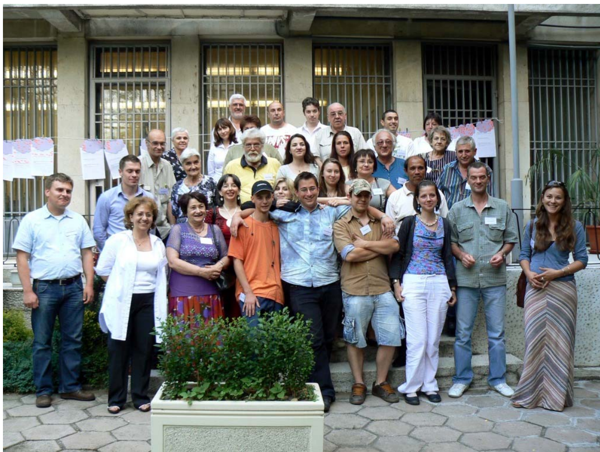
Citizen Panel in Bulgaria

Organised in Sofia on 20 – 21 June 2009 at the Applied Research and Communications Fund